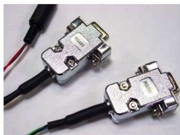
Figure 1: Female DB9 and Pin Number Orientation (left), RS-232 & RS-485 DB9s (right)