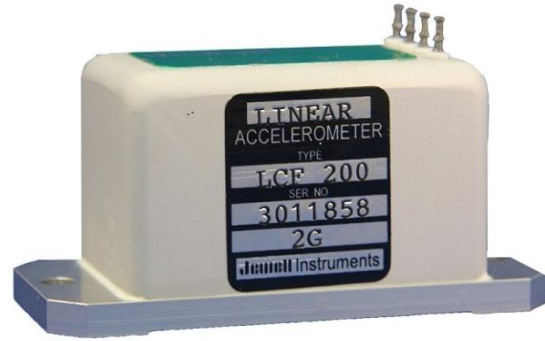
Dimensional Diagram: LCF-200 Series Accelerometer