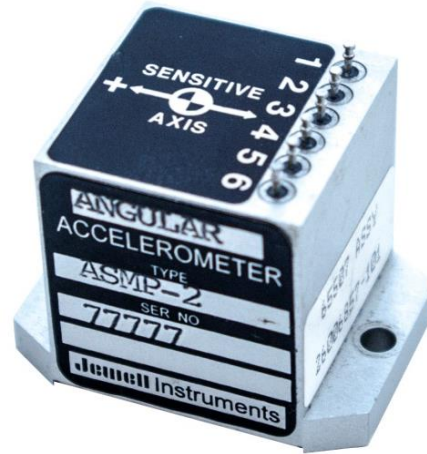
Outline Drawing: Dimensional Drawing for the ASM Accelerometer